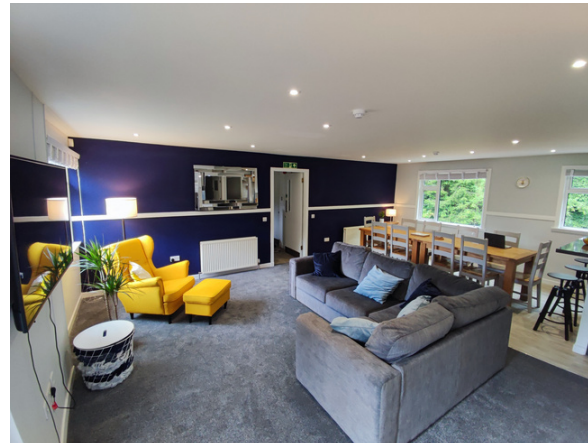
Caroline Cottage's new living room

Thanks to Places for People donating a portable cabin to us, our Estates Team now have a dedicated base, complete with a new sign designed by one of our young people. See picture above.