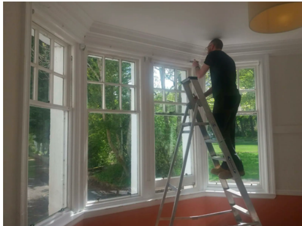
Eason Cottage's living room gets a refresh